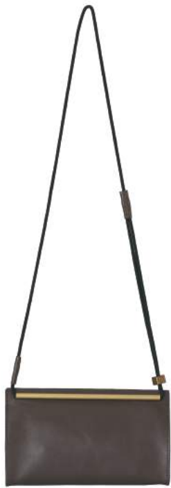
Gouda Shoulder Bag