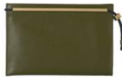
Brie Vertical Pouch