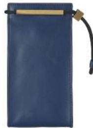
Gruyere Horizontal Pouch